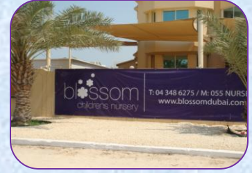
Blossom Village Nursery Umm Suqeim 1