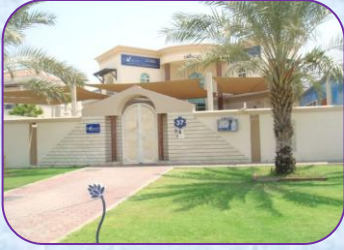
Blossom Nursery Umm Al Sheif

“We are committed to providing a learning space that is both secure and stimulating”