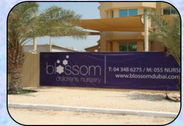
Blossom Village Nursery Umm Suqeim 1