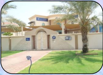
Blossom Nursery Umm Al Sheif

“We are committed to providing a learning space that is both secure and stimulating”