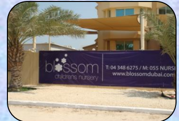
Blossom Village Nursery Umm Suqeim 1